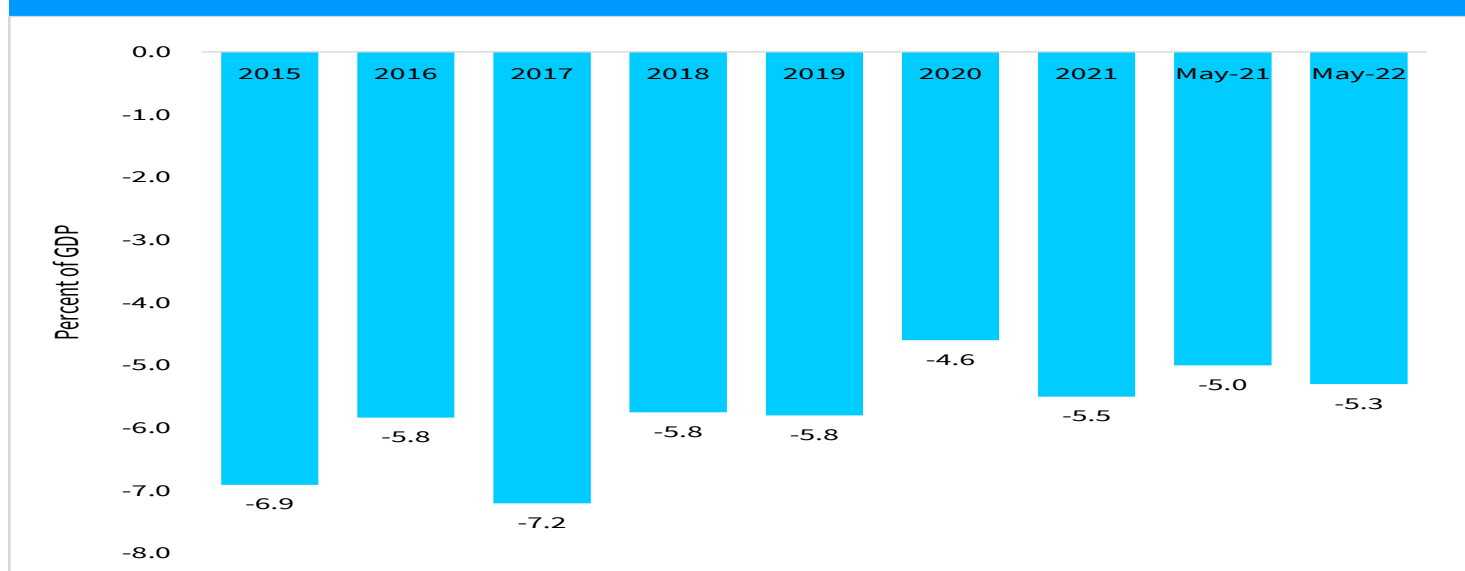
Chart 1: Current Account