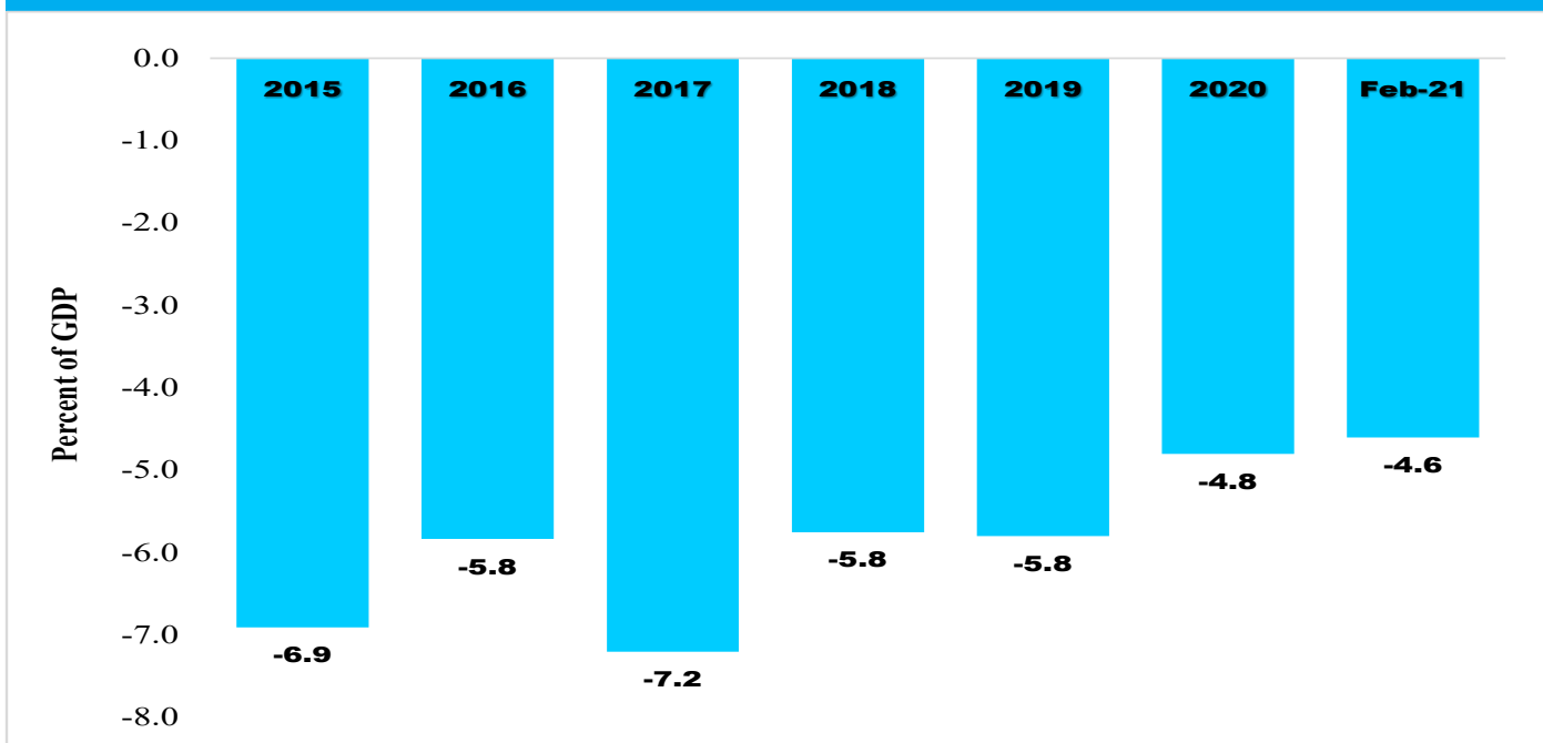
Chart 1: Current Account Balance