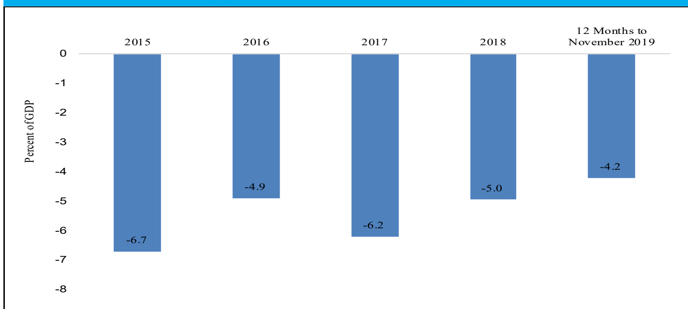
Chart 1: Current Account