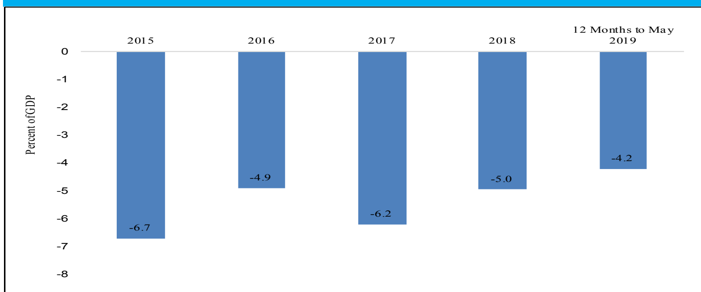
Chart 1: Current Account