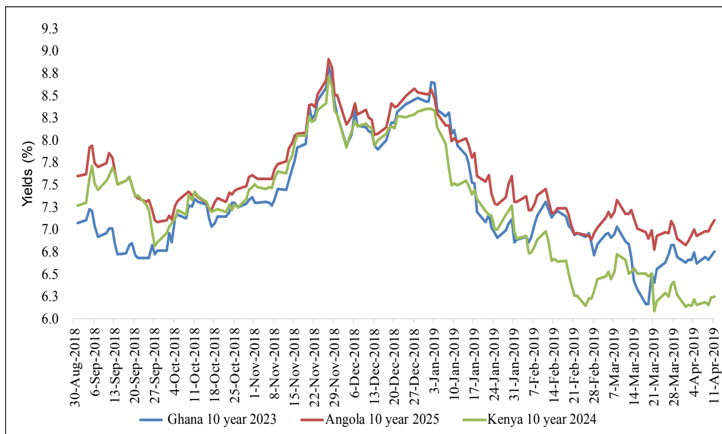
Chart 2: Yields on 10 year Eurobonds for Selected African Countries