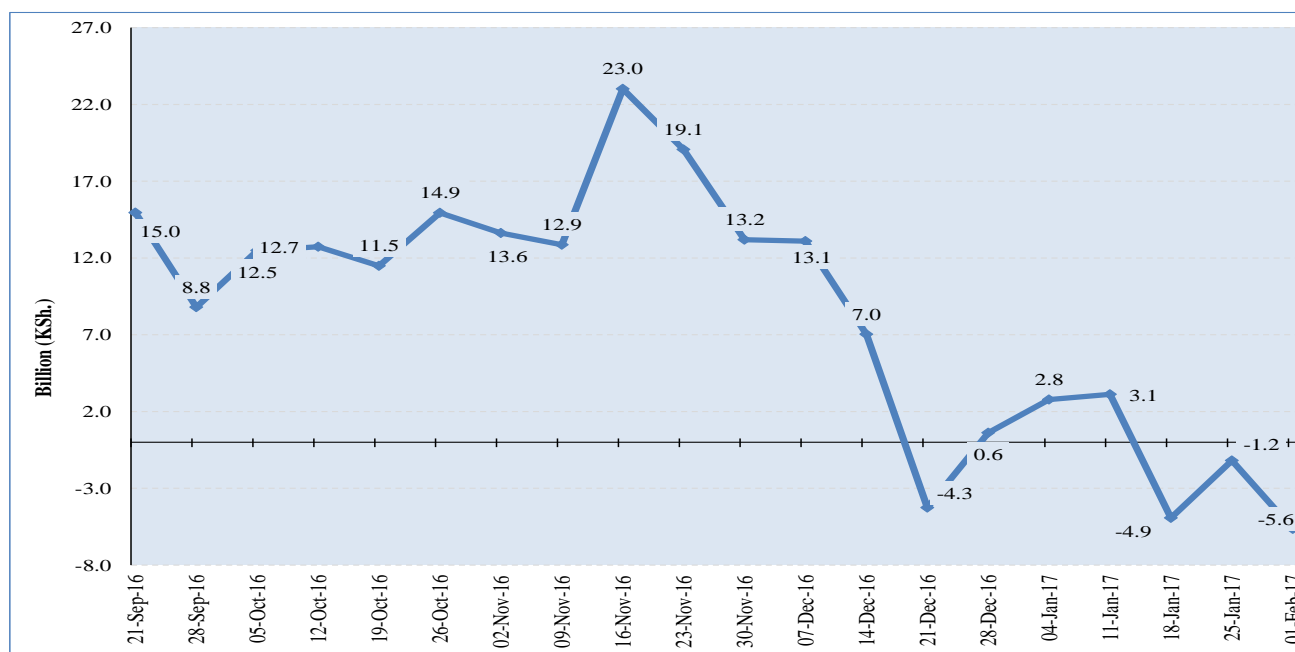
CHART B: COMMERCIAL BANKS EXCESS RESERVES